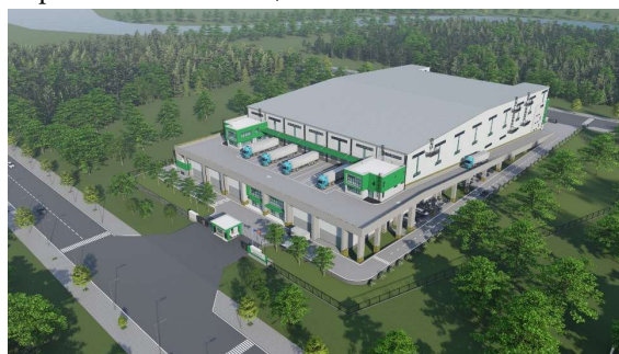
External view of the warehouse